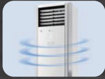
Beautiful Integrated Design