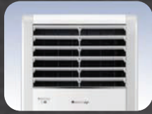
Precise Air Guiding